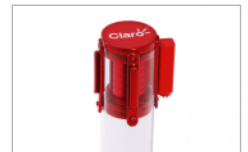
Custom post top labels