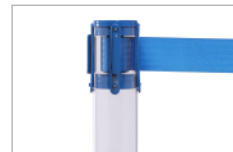
Colored belt cassettes