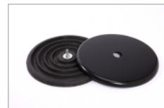
Iron base with replaceable cover