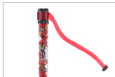
Brake for slow safe belt retraction