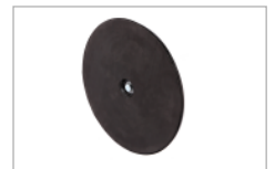
Full coverage floor protector