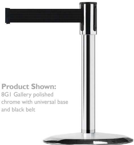
Product Shown: 8G1 Gallery polished chrome with universal base and black belt